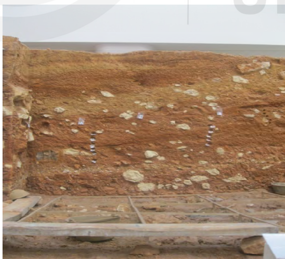
Fig. 2: Vertical Excavation

(Photo taken by Ranjana Ray at Museum of Human Evolution, Burgos, Spain)