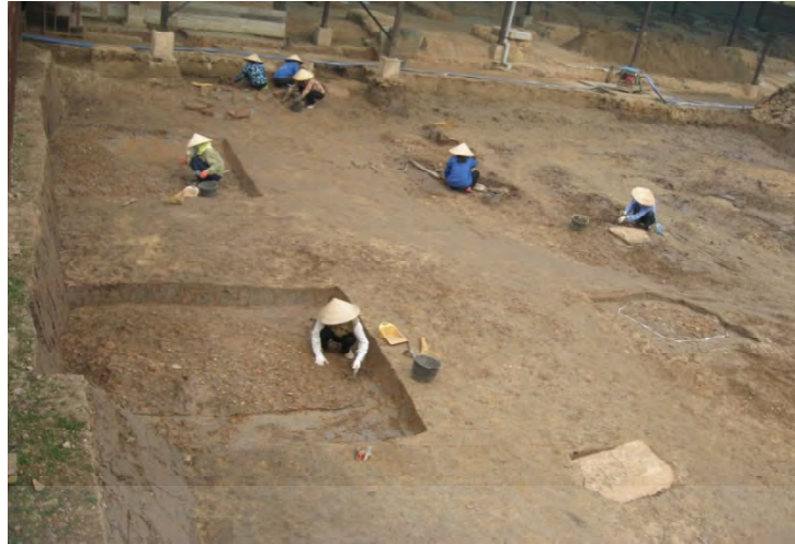
Fig. 3: Excavation of Large Area

activities that were carried out at the site. If a settlement site is dug, the excavator will try to expose as many habitation levels as possible and also would like to expose all kinds of activities that happened in the past. There too is no hard and fast rule for excavating large areas. It depends on the objective set forth by the excavator and the type of site to be excavated.