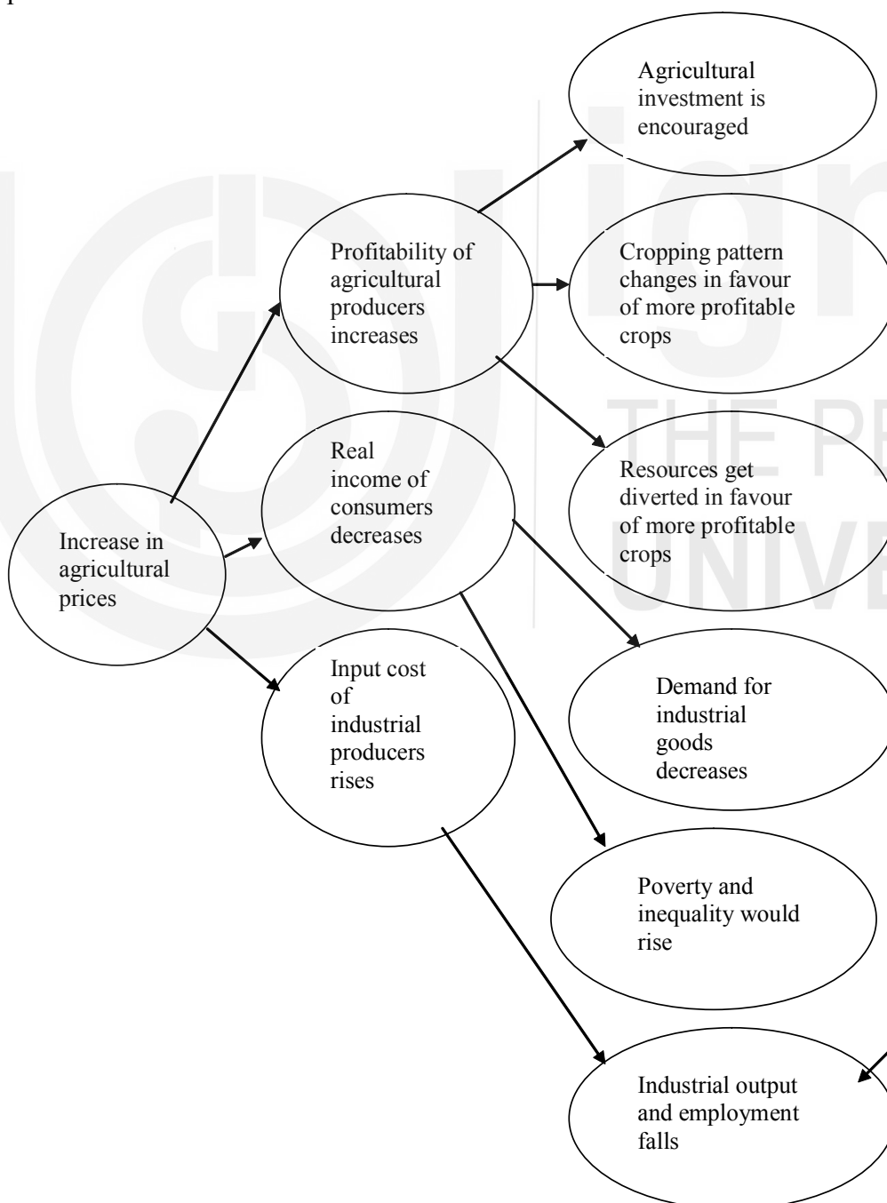
Fig. 20.1: Impact of Agricultural Price

Rising price of food affects people in a developing country badly. It is a fact that food prices have a strong influence on the general inflation rate as food items constitute a substantial portion of the items in the ‘basket of goods’ considered for calculating the consumer price index. Food prices and the general price level of all goods taken together, therefore, rise or fall in tandem. In recent years, especially since 2006, food prices in India has risen at a faster rate. For instance, while in February 2004, food price rose by 4.4 percent per annum, in 2006 it rose by 6.1 percent, in 2007 by 9.2 percent, and in 2010 it touched a peak of 20.2 percent. The high growth of food price shows a lack of response to the policy measures pursued. Figure 20.1 presents the impact of agricultural price rise in a nutshell.